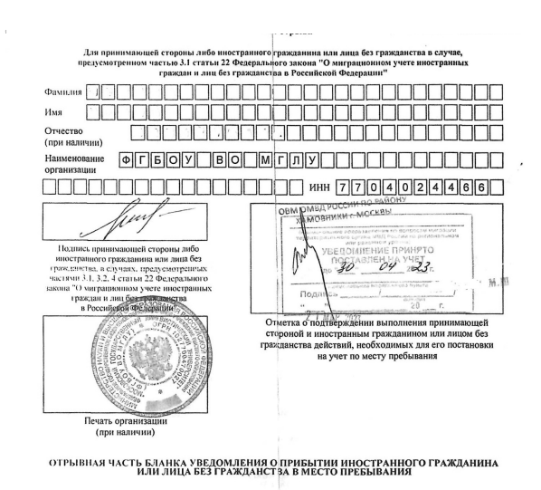
Document 3 (Certificate, example)